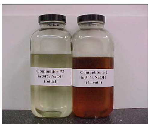
Figure C: Competitor 2

Initial Appearance: Gardner Zero, Clear One Month: Gardner Six, Clear