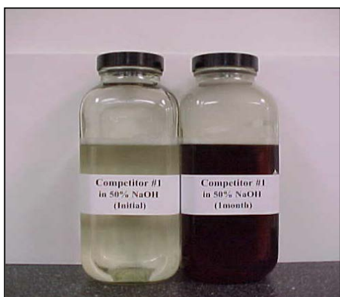
Figure B: Competitor 1

Initial Appearance: Gardner Zero, Clear One Month: Gardner One, Clear