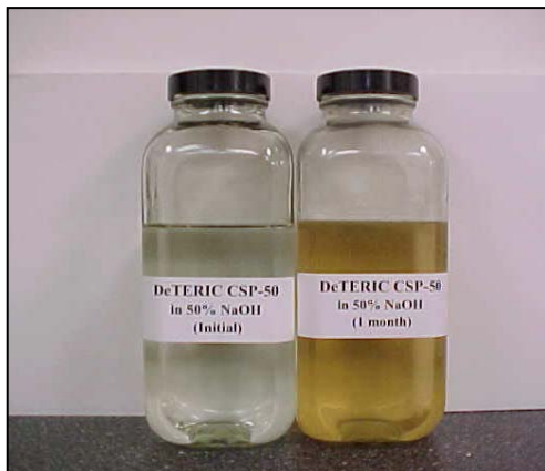
Figure A: DeTERIC CSP-50

All test solutions are 3% surfactant by weight in 50% active sodium hydroxide. Appearance and Gardner Color of each solution were determined initially and after one month at ambient temperature. Similar results were observed in 45% active potassium hydroxide.